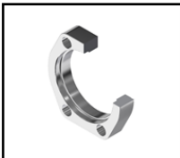
90° Flare Flange Clearance Holes Metric only FFCN14, FFCN34, FFCN18 Page D2