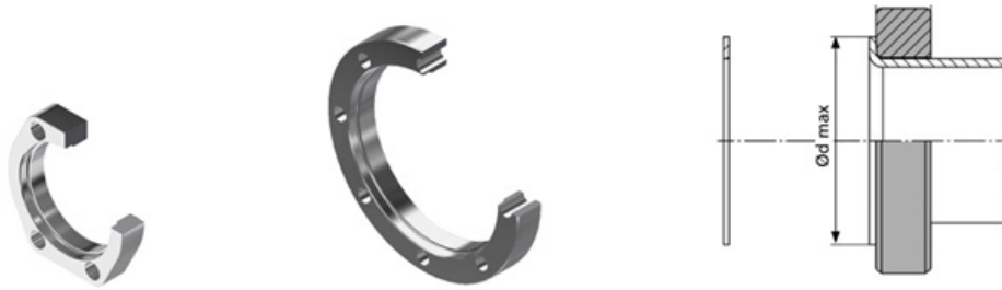
1-1/2" – 5" Flanges

Flange pattern according to SAE J518 Code 61 (ISO 6162-1)